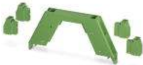
Illustration shows a fully mounted version of the electronic housing

Housing upper part, complete with PCB terminal blocks for full assembly. 8-pos., housing width: 12.5 mm