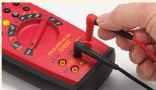
Universal plugs compatible with all 4 mm shrouded inputs