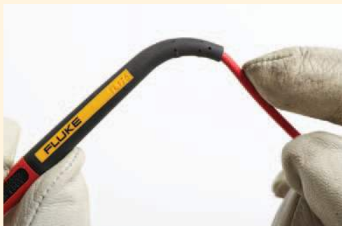
Extreme strain relief tested to withstand over 30,000 bends