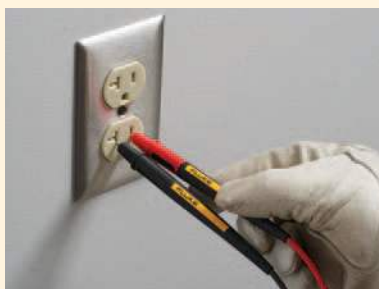
Increase tip exposure for CAT II probing