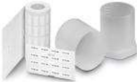
The figure shows the EML (20X8)R product variant

Label, Roll, white, Unlabeled, Can be labeled with: Thermomark R, Thermomark X, Thermomark S, Mounting type: Adhesive, Lettering field: 10 x 7 mm