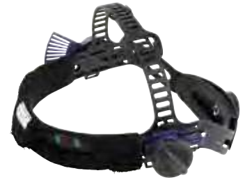
New headband with smooth ratchet for precise tightening.

Additionally, these helmets' affordable price and ease of use ensures that their superior quality and expressive style are accessible to even the most occasional welders.