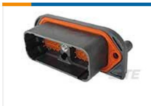
TE Part #DRC23-40PA-N012 HDR, 40P, BLK, RA, AU/NI/CU, A