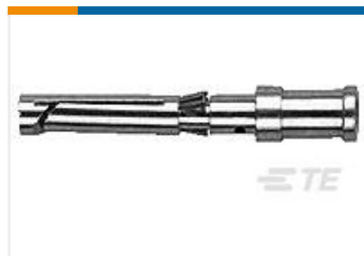
TE Part #5-1105051-1 HN.D-C-BU.AG.2.5