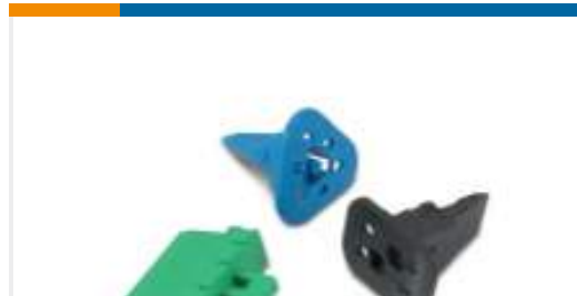
TE Part #W4S-ZZ Wedgelocks: DEUTSCH DT