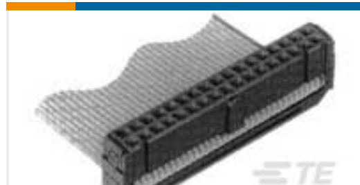
TE Part #1658622-3 16 NOVO MIL/CTR 30DP, LEAD FREE