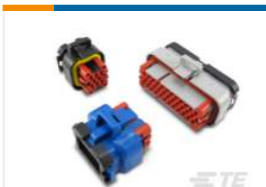
TE Part #770680-1 AMPSEAL Receptacle Housings