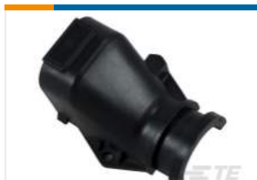
TE Part #776463-1 STRAIN RELIEF, 35 POSITION AMPSEAL