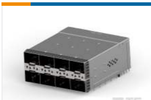
TE Part #2339978-6 SFP56 STACKED 2X4 RECEPTACLE ASSEMBLY