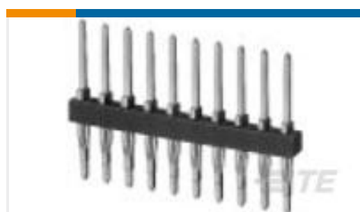
TE Part #3-102898-8 05 MODII HDR SRST UNSHRD A/PIN