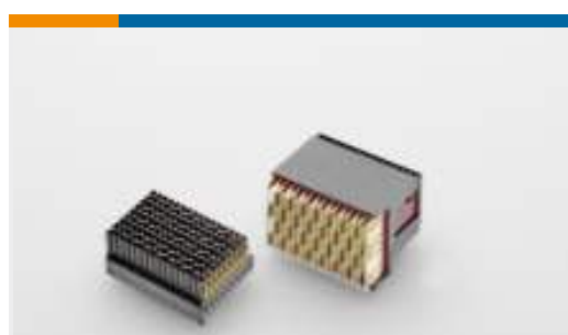
TE Part #2352032-1 VERTRECCASSY, MULTIGIG RT3