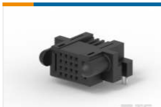
TE Part #2-6450880-0 MBXL R/A RCPT 1LP + 16S + 1LP