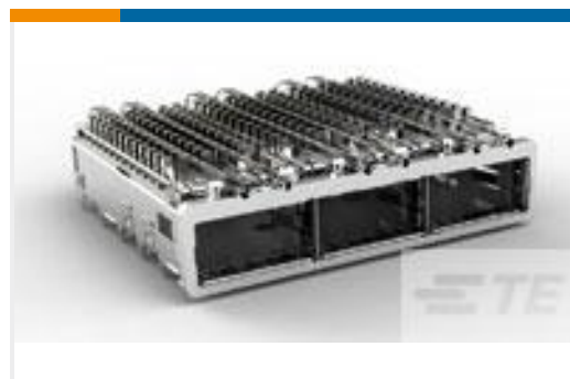
TE Part #2057042-5 1x3 QSFP Kit Assy Lp&HS, SAN