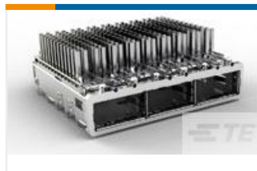
TE Part #2057042-8 1x3 QSFP Kit Assy LP&HS, Networking