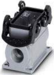
Figure shows a product variant with a height of 74 mm

HEAVYCON box mounting base B10, with double locking latch, height 52 mm, with supports 2xM20