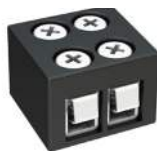
TAPE-TO-WIRE BLOCK CONNECTOR