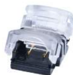
TAPE-TO-TAPE GRIPPER CONNECTOR