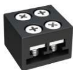
TAPE-TO-TAPE BLOCK CONNECTOR