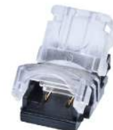
TAPE-TO-WIRE GRIPPER CONNECTOR