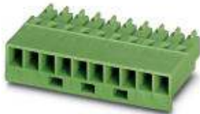
The illustration shows a 16-position version

Please be informed that the data shown in this PDF Document is generated from our Online Catalog. Please find the complete data in the user's documentation. Our General Terms of Use for Downloads are valid ( http://download.phoenixcontact.com )