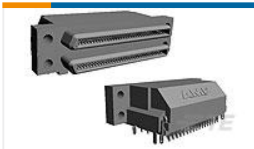
TE Part #5787962-1 .8MM CHAMP STACK RCPT ASSY