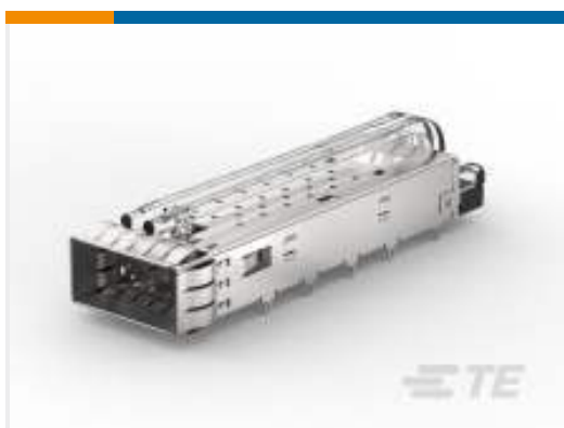
TE Part #1888971-4 QSFP TB CAGE ASSY, W/LP, NO HS