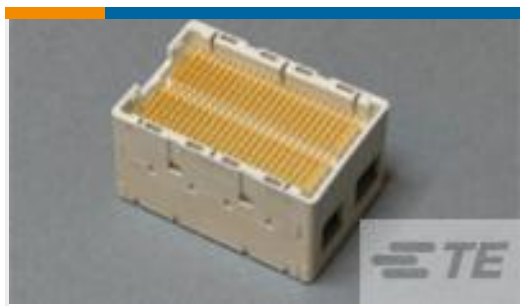
TE Part # 7-1761612-0 STEP-Z PLUG 20MM 104P LF ST