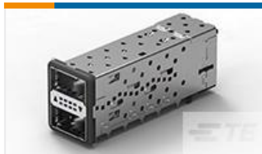
TE Part #2085945-1 QSFP+ Assy, 2x1, Gskt, 2LP-Outr, Sn EONs