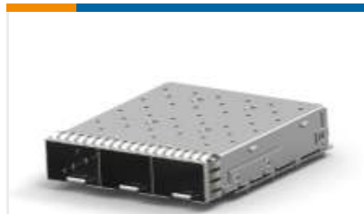
TE Part #2302014-2 zSFP+ Cage Assembly: EMI Springs