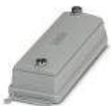
HEAVYCON ADVANCE B24 IP65 protective cover, for panel mounting side, with screw locking, with retaining cord, diameter of retaining cord eyelet: 3 mm

Protective covers - HC-B 24-TMS-SD-IP65 - 1690804