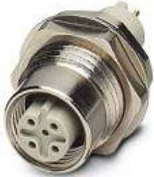
Sensor/Actuator flush-type socket, 5-pos., M12, B-coded, rear/screw mounting with Pg9 thread, with straight solder connection

Please be informed that the data shown in this PDF Document is generated from our Online Catalog. Please find the complete data in the user's documentation. Our General Terms of Use for Downloads are valid ( http://download.phoenixcontact.com )