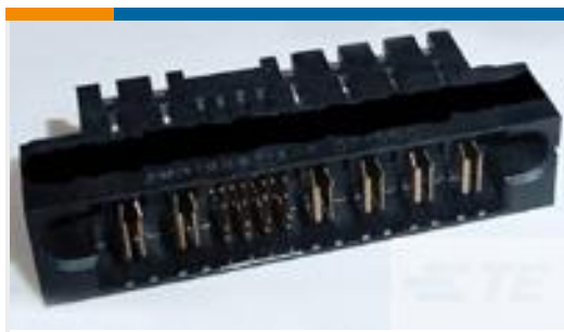
TE Part #6600150-1 MBXL R/A HDR DB 4P+24S