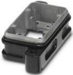
HEAVYCON B10 panel mounting base, HPR series, for screw locking, for increased environmental and EMC requirements

Please be informed that the data shown in this PDF Document is generated from our Online Catalog. Please find the complete data in the user's documentation. Our General Terms of Use for Downloads are valid ( http://phoenixcontact.com/download )