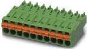
The figure shows a 10-pos. version of the product in green

Plug component, Nominal current: 8 A, Rated voltage (III/2): 160 V, Number of positions: 4, Pitch: 3.81 mm, Connection method: Push-in spring connection, Color: black, Contact surface: Tin