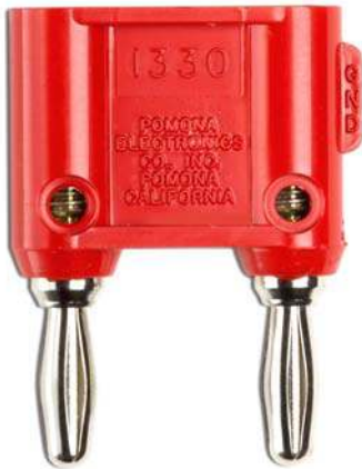
Model 1330 Double Banana Plug with Component Mounting Area