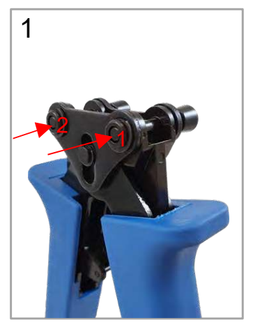
Unlock 2 pins by pushing towards them.