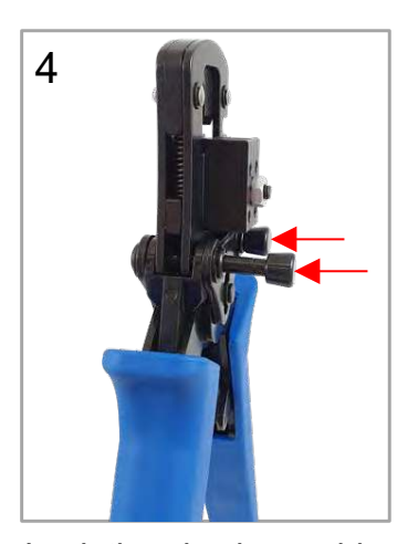
Lock the pins by pushing toward them. Hand Tool is ready to use.