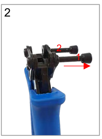
Extract the pins.