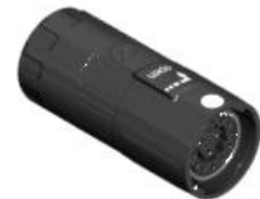
Contact Arrangement mating view

E ST B 204 NN 00 31 0003 000 E S B 204 N 00 31 0003 000