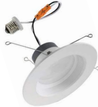
SILVER AND WHITE BAFFLE OPTION