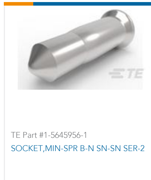
TE Part #1-5645956-1 SOCKET,MIN-SPR B-N SN-SN SER-2