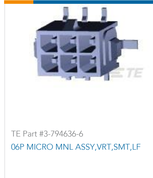
TE Part #3-794636-6 06P MICRO MNL ASSY,VRT,SMT,LF