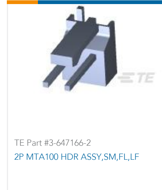
TE Part #3-647166-2 2P MTA100 HDR ASSY,SM,FL,LF