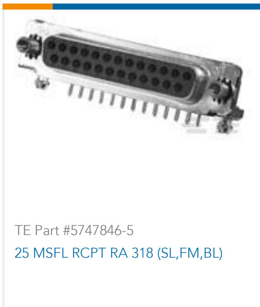
TE Part #5747846-5 25 MSFL RCPT RA 318 (SL,FM,BL)