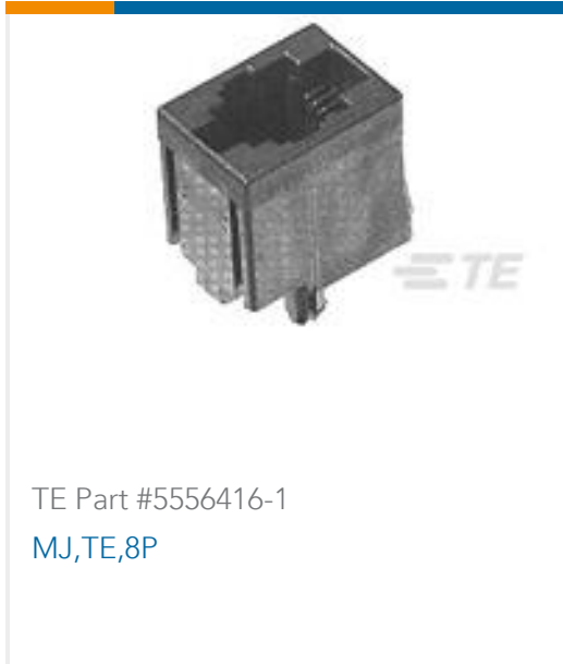
TE Part #5556416-1 MJ,TE,8P