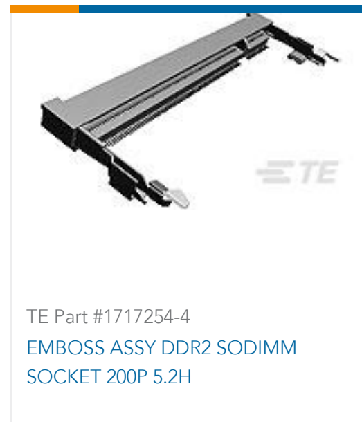
TE Part #1717254-4 EMBOSS ASSY DDR2 SODIMM SOCKET 200P 5.2H