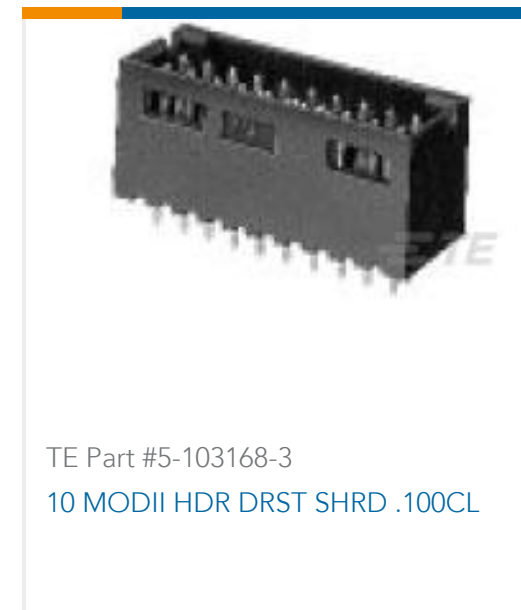
TE Part #5-103168-3 10 MODII HDR DRST SHRD .100CL