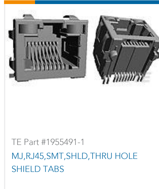
TE Part #1955491-1 MJ,RJ45,SMT,SHLD,THRU HOLE SHIELD TABS