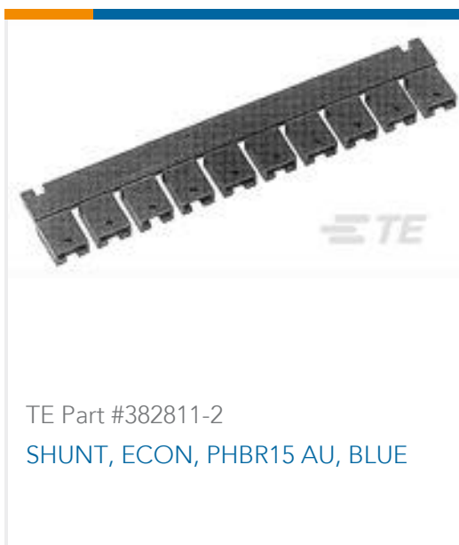
TE Part #382811-2 SHUNT, ECON, PHBR15 AU, BLUE