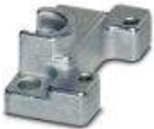
Panel mounting flange for HEAVYCON-ADVANCE TMS housing with screw locking