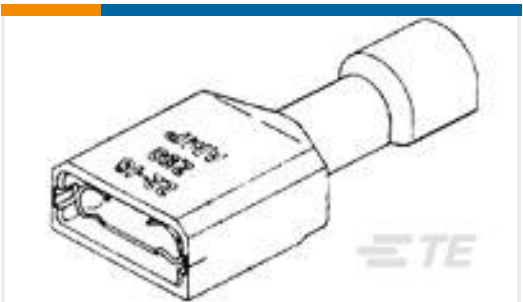
TE Part #3-350819-2 ULTRA-FAST 250 ASY REC 16-14 AWG TPBR