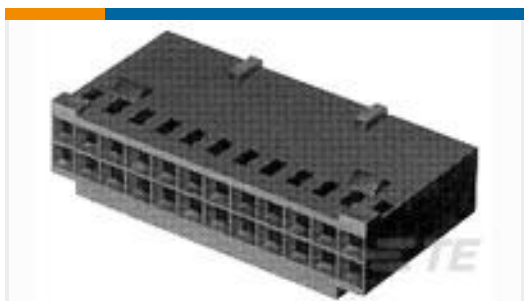
TE Part #1-87631-5 20 MODIV HSG COMP DR .100 POL