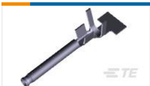
TE Part #171637-1 MINI U-M-N-L SOCKET CONTACT