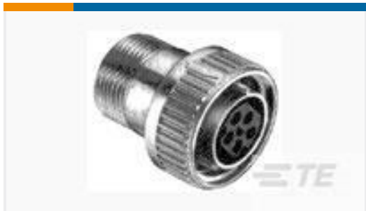
TE Part #208457-1 CMC PLUG ASSEMBLY,SZ 28-24