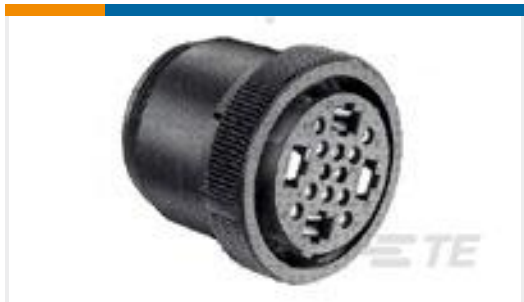
TE Part #211824-1 CPC PLUG ASSEMBLY 23-13