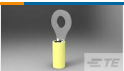
TE Part #2-35110-1 PIDG 12-10 R 1/4; TAPE