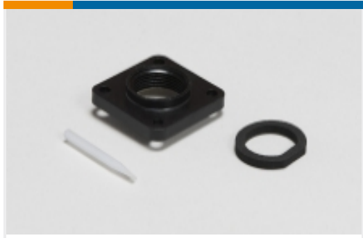
Circular Connector Seals(36)