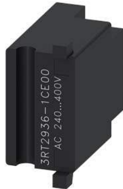
Surge suppressor, RC element, 240 ... 400 V AC, for contactors Size S2