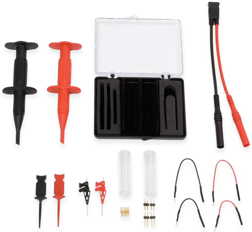
The ZD200 Accessory kit includes an assortment of leads, clips, and straight tips.