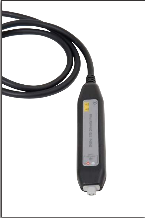
The ZD200 provides 2 closely spaced differential inputs to connect directly to header pins, or connect probe tips or leads.