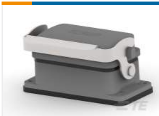
TE Part #T2120100220-000 ZGGP-H10BSK 1-7/2-8/3-9/4-6/5-10