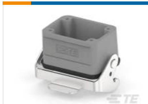
TE Part #T1730060000-000 H6B-TBF-T