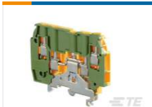
TE Part #1SNA195638R2300 M4/6.4A.P