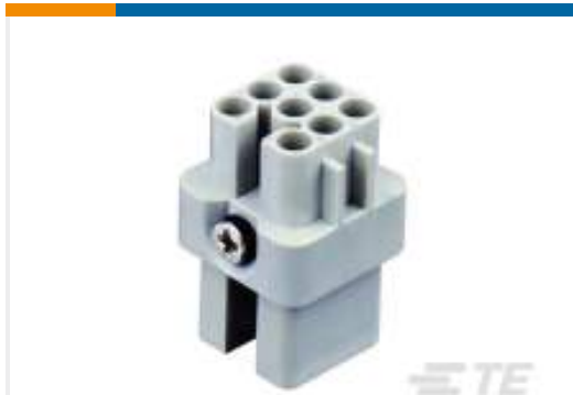
TE Part #T2020082201-000 HD-008-F