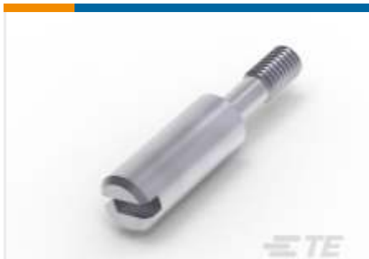
TE Part #T0931003003-000 CODING-PIN-M3