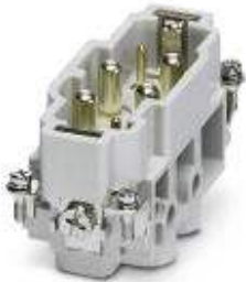
HEAVYCON plug insert, K4/2 series, for 4 power and 2 control contacts, screw connection, product with OEM logo

Please be informed that the data shown in this PDF Document is generated from our Online Catalog. Please find the complete data in the user's documentation. Our General Terms of Use for Downloads are valid ( http://download.phoenixcontact.com )