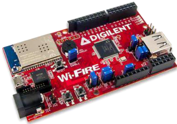
The Wi-FIRE board.