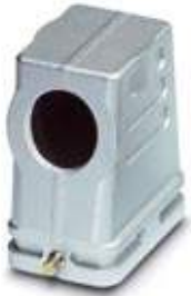
HEAVYCON sleeve housing B6, for single locking latch, height 70 mm, with thread M32, lateral cable outlet, EMC version

Please be informed that the data shown in this PDF Document is generated from our Online Catalog. Please find the complete data in the user's documentation. Our General Terms of Use for Downloads are valid ( http://download.phoenixcontact.com )