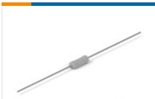
TE Part #9-1676123-2 1/2W SM M/OX 5% 5K1