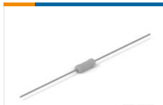
TE Part #8-1676123-6 1/2W SM M/OX 5% 3K0