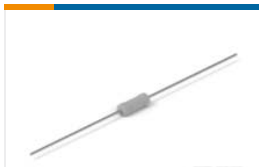
TE Part #8-1676123-4 1/2W SM M/OX 5% 2K4