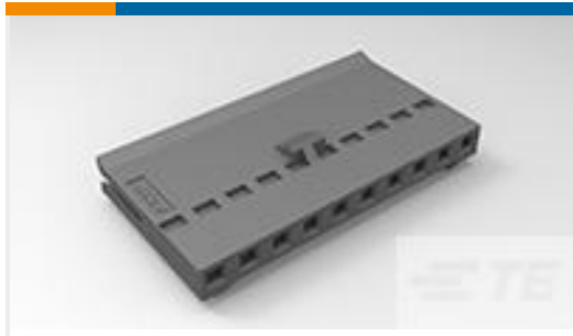
TE Part # 1-487769-0 012 HOUSING FFC RCPT 100CL SR