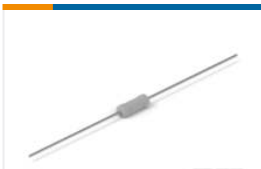
TE Part #8-1676123-1 1/2W SM M/OX 5% 1K8