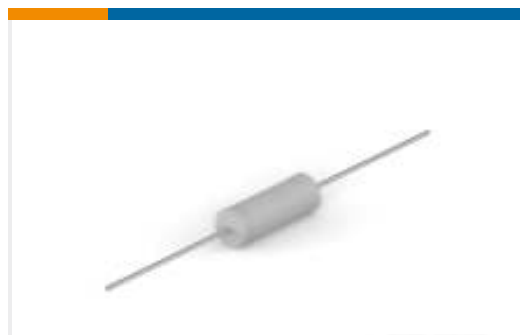
TE Part #5-2176412-9 5W XSM M/OX 5% 1K3