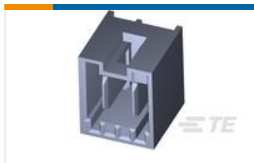
TE Part #3-1971846-2 2P, RAST 5 Tab Header, THV