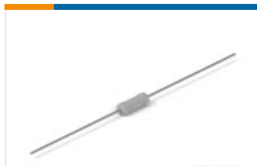
TE Part #8-1676123-5 1/2W SM M/OX 5% 2K7