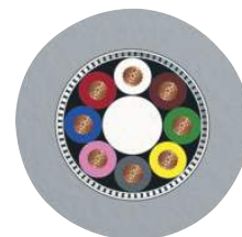
PUR, gray, shielded [285]