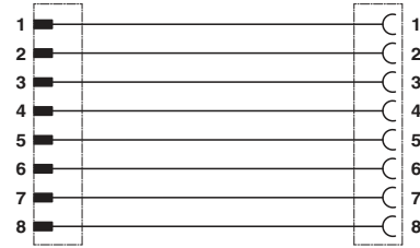
Contact assignment of M12 connector/socket