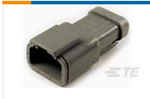
TE Part #DTM04-3P-E003 REC, 3P, GRY, N, CAP