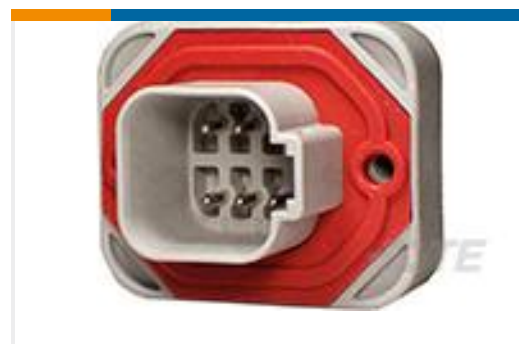
TE Part #DT15-6P HDR, 6P, GRY, ST, NI/CU