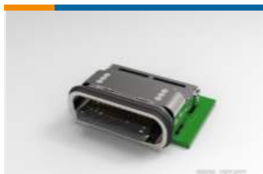
TE Part #2305018-2 USB TYPE C, REC IPX8 ON BOARD DUAL SMT