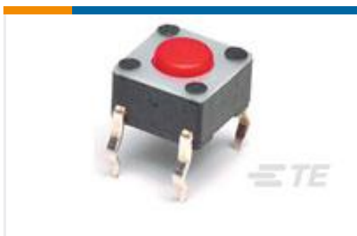
TE Part #1825910-3 FSM2JAH=6MM TACT SWITCH, HIGH TEMP