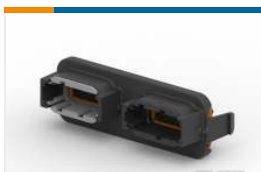
TE Part #DTM1312PA12PBR008 HDR, 24P, BLK, RA EEC, NI/CU, AB