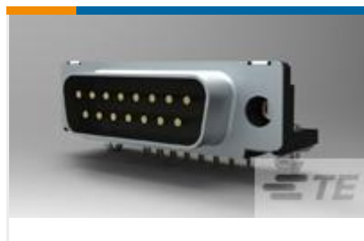
TE Part #5747841-4 15 MSFL PLUG RA 318 (IN,FM,BL)