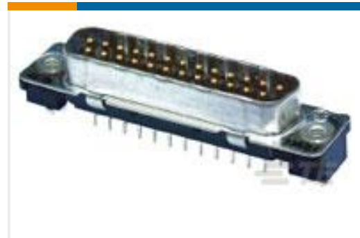
TE Part #5747871-4 09 PLUG SP/FMS STD