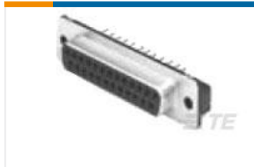
TE Part #2-5747709-0 37 RCPT SP/FMS BRDLK