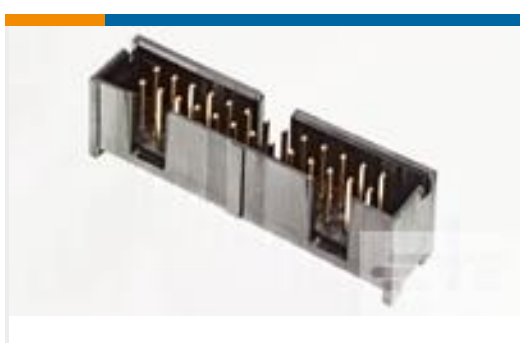
TE Part #2-1761603-3 IDC LOW PRO HDR 10P VERT BLUE