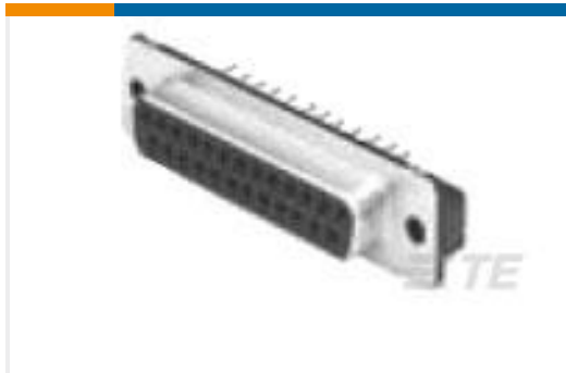
TE Part #5747150-7 09 RCPT SP/FMS INSRT