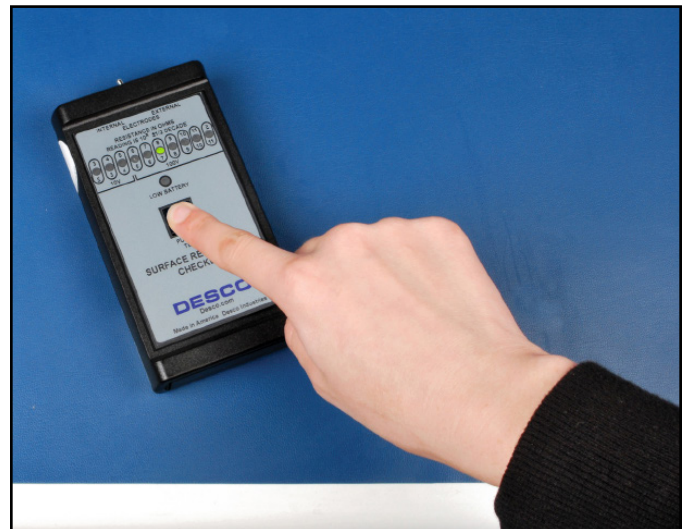
Figure 3. Using the parallel electrodes to measure surface resistance

If the measurement is outside acceptable limits, clean the surface with an ESD cleaner containing no insulative silicone such as Desco 10435 Reztore® Surface & Mat Cleaner, and re-test to determine if the cause of failure is an insulative dirt layer or the ESD worksurface material.