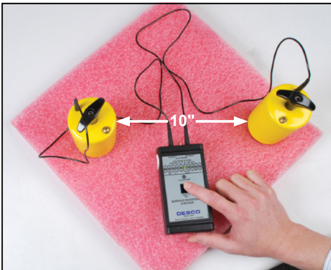
Figure 4. Using the 19641 test leads and 50003 five-pound electrodes to measure Rtt

Clean the material's surface for test lab measurements, but do not clean the surface for materials that are already installed. Only clean and re-test the installed material if failure occurs.