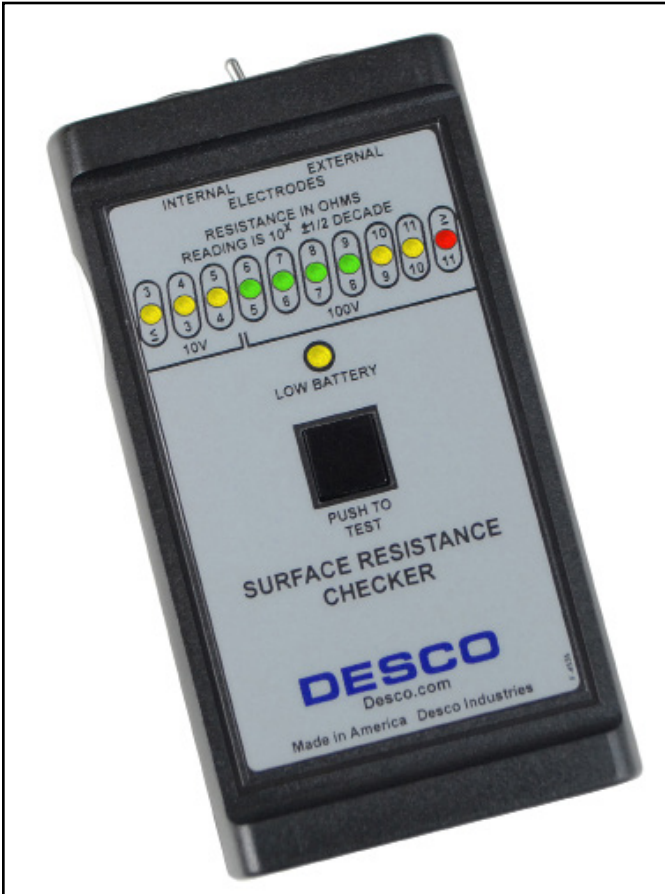
Figure 1. Desco 19640 Surface Resistance Checker