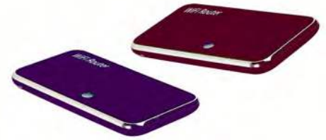
Mobile Wi-Fi* devices