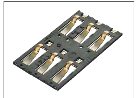
Block-Style SIM Connector, 0.30mm height (Series 78545)