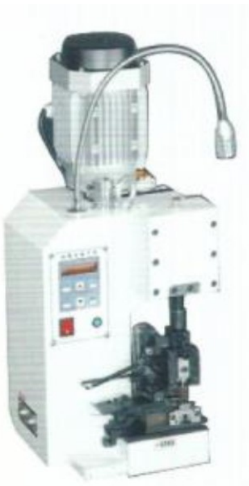
FLH-CT-0-02 CRIMP MACHINE WITH APPLICATOR