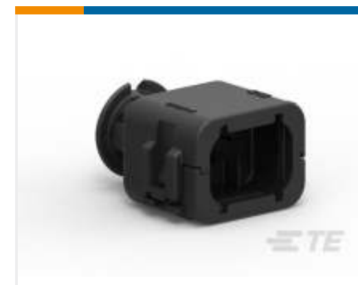
TE Part #2292860-1 AS16 BACKSHELL, 2P CAP, SMOOTH EXIT, MC