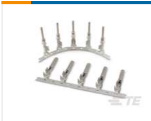
TE Part #776492-1 Contacts: Size 16, 13A