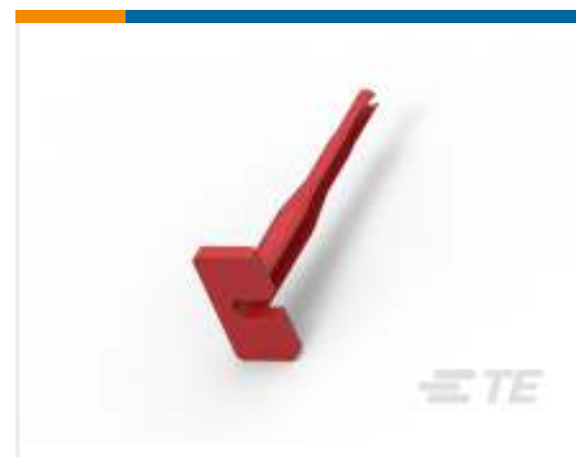
TE Part #776106-1 EXTRACTION TOOL