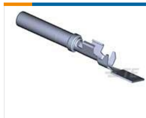
TE Part #1062-16-0677 SOC, SF, SIZE 16, 16-20, SN/SN