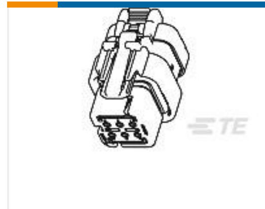
TE Part #776532-4 AS 16, 8P PLUG ASSY, RD, KEY 4