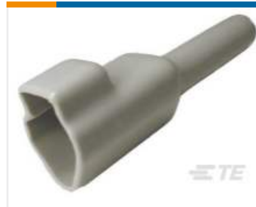
TE Part #DT3S-BT BOOT, 3P, PLG, ST, GRY