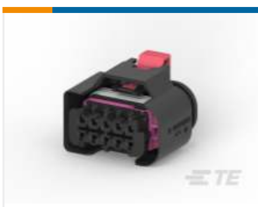
TE Part #1-2282337-5 10POS, MCON 1.2 LL REC SEALED 2ROW