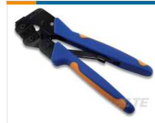
TE Part #2119118-1 SDE Commercial Tool & Die