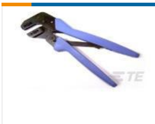
TE Part #91337-1 SIZE 16 PRO-CRIMPER ASSY.