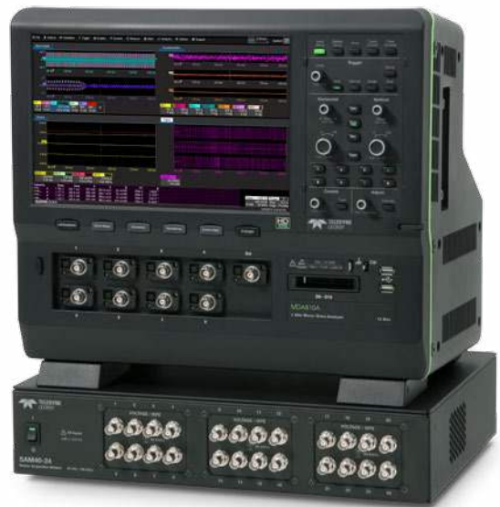
8 analog channel + 16 digital channel, 1 GHz, 12 bit resolution HDO8108 high definition oscilloscope with SAM40-24 provides 8+16+24 channel acquisition capability.

The most basic system available combines a 350 MHz, 500 MHz, or 1 GHz 12-bit resolution, 4 channel oscilloscope (HDO4000A or HDO6000A Series) with a SAM40-8 eight channel acquisition module. This triples the number of available inputs for a very modest price, and preserves high bandwidth oscilloscope inputs for the most important uses, or provides capability to view more high bandwidth signals than would have previously been possible without the SAM40. 16 and 24 channel acquisition modules may also be used. MSO oscilloscope models further add 16 digital logic input channels.