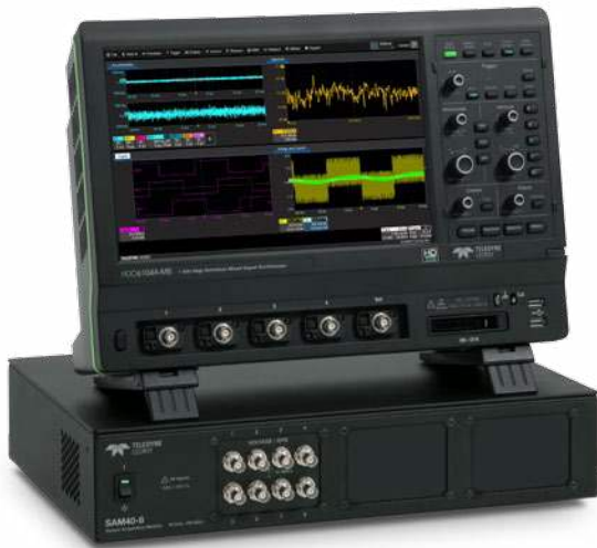
4 analog channel + 16 digital channel, 1 GHz, 12 bit resolution HDO6104A-MS high definition oscilloscope with SAM40-8 provides 4+16+8 channel acquisition capability.

Engineers commonly use multiple instruments to debug and validate complex deeply embedded control systems, mechatronics, and electro-mechanical systems. Multiple instruments report different information on different displays and in different formats. An HDO with a sensor acquisition module cost-effectively replaces multiple instruments with one consolidated view of system performance. Leverage the Teledyne LeCroy deep toolbox to perform math, measurements, pass/fail and other analysis on all acquired data, or apply an application package to gain even faster time to insight.