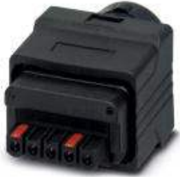
Connector component, Degree of protection: IP65, Number of positions: 5

Please be informed that the data shown in this PDF Document is generated from our Online Catalog. Please find the complete data in the user's documentation. Our General Terms of Use for Downloads are valid ( http://phoenixcontact.com/download )