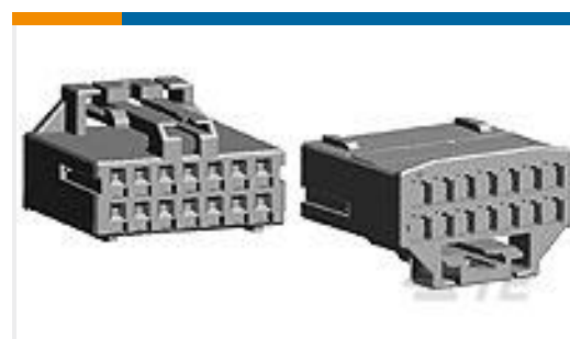
TE Part #936124-1 14POS MQS REC