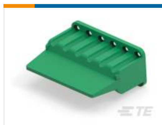
TE Part #WM-12S-B026 WEDGE LOCK, 12P, PLG, GRN, DTM