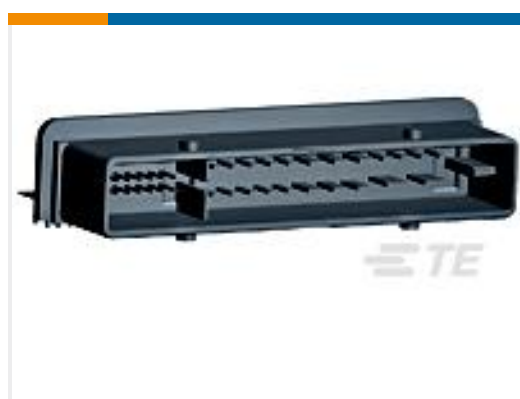
TE Part #1534531-1 TAB HEADER ASSY 38P