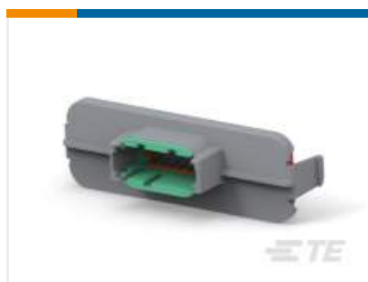
TE Part #DTM13-12PC-R008 HDR, 12P, BLK, RA EEC, NI/CU, C