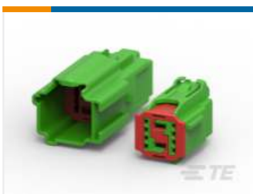
TE Part #9-1419166-0 GET .64 CONNECTOR SYSTEM, CONNECTOR HSG