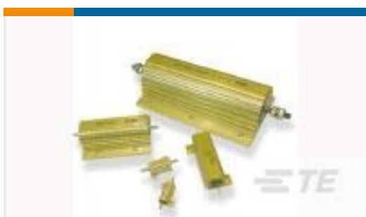
TE Part #1-1630012-9 HSC150 2R2 5%