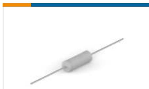
TE Part #2-2176412-7 5W XSM M/OX 5% 62R