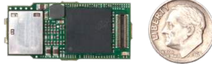
DM3730 / AM3703 Torpedo™ + Wireless SOM

The DM3730/AM3703 Torpedo + Wireless SOM occupies less than one square inch, but boasts PC-like speeds up to 1 GHz with long battery life. Partnered with such high performance is a startlingly low power consumption in suspend state. This balance of speed and power is accomplished through Logic PD's vast system design experience; understanding the most detailed workings of each component and their interaction with one another creates a product that operates at optimal efficiency.