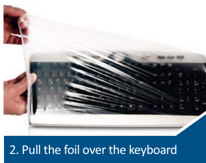
2. Pull the foil over the keyboard