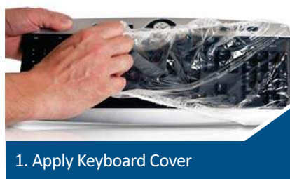
1. Apply Keyboard Cover