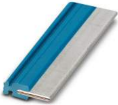
Plug-in bridge, length: 50 mm, color: blue

https://www.phoenixcontact.com/us/products/1081051