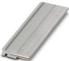
Plug-in bridge, length: 50 mm, color: gray

https://www.phoenixcontact.com/us/products/1081053