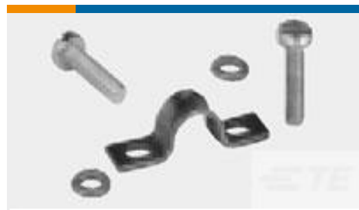
TE Part #4-1106302-9 SCHELLENSET 7MM