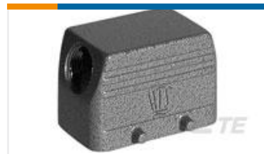
TE Part #1-1102261-6 HB.10.STS.1.16.G