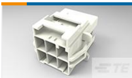
TE Part #1-1971775-3 PTL 2X3 CAP PANEL MT STD TEMP KEY A NAT