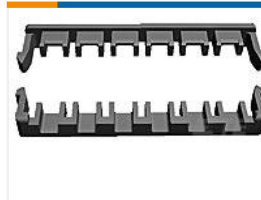
TE Part #1376396-1 5MM POWER KEY D/L PLATE GREEN