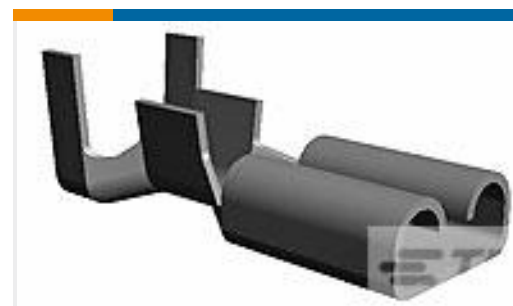
TE Part #60487-1 187 FASTON REC 18-16 AWG BR