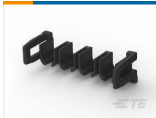
TE Part #1971778-3 Locking Plate, POWER TRIPLE LOCK, TPA