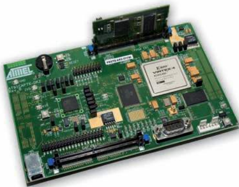
CAP7X Mezzanine Board