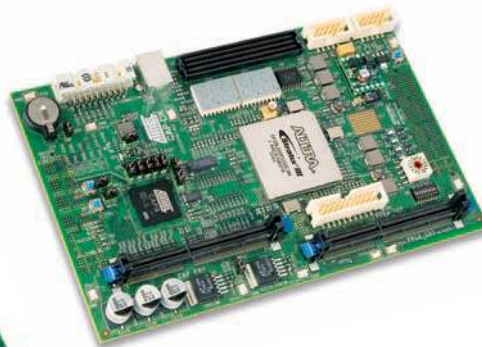
CAP9HA Mezzanine Board