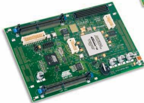
CAP9A Mezzanine Board