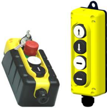
MOBILE-PENDANT FIXING (with WALL BRACKET accessories) WALL FIXING