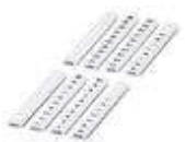
Zack Marker strip, flat, Can be ordered: Strip, white, Labeled according to customer specifications, Mounting type: Snap into flat marker groove, For terminal block width: 5 mm, Lettering field: 5.15 x 5.15 mm

Zack Marker strip, flat - ZBF 5 CUS - 0825025