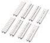
Zack marker strip, Can be ordered: Strip, white, Labeled according to customer specifications, Mounting type: Snap into tall marker groove, For terminal block width: 5.2 mm, Lettering field: 5.15 x 10.5 mm

Marker for terminal blocks - UC-TM 5 CUS - 0824581