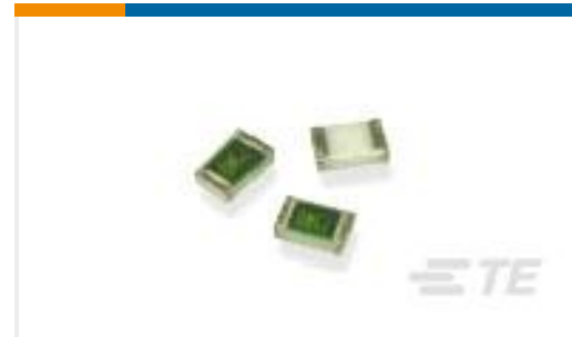
TE Part #6-2176087-6 RP 1J 0.166W 332R 0.1% 25PPM 1K RL