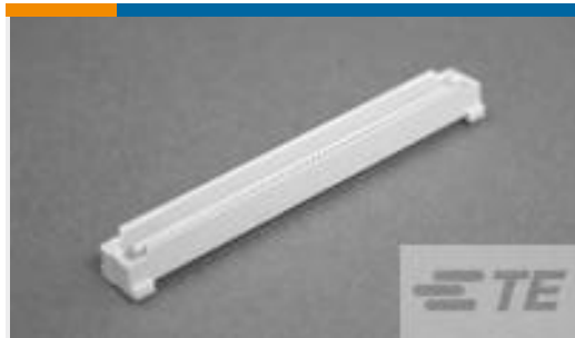
TE Part #5177986-2 0.8FH,P05H.5,060,08/Sn,TR,SC