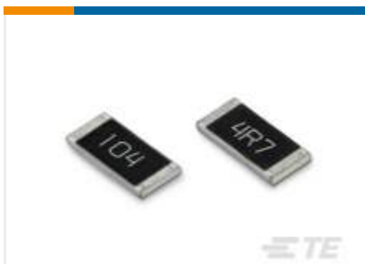
TE Part #2176456-2 CPF 0603 1R02 0.1% 25ppm 1K RL