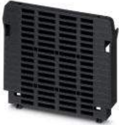
Panel mounting base, Color: black

Please be informed that the data shown in this PDF Document is generated from our Online Catalog. Please find the complete data in the user's documentation. Our General Terms of Use for Downloads are valid ( http://phoenixcontact.com/download )