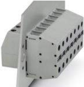
The illustration shows version HDFKV 25-TWIN

Please be informed that the data shown in this PDF Document is generated from our Online Catalog. Please find the complete data in the user's documentation. Our General Terms of Use for Downloads are valid ( http://phoenixcontact.com/download )