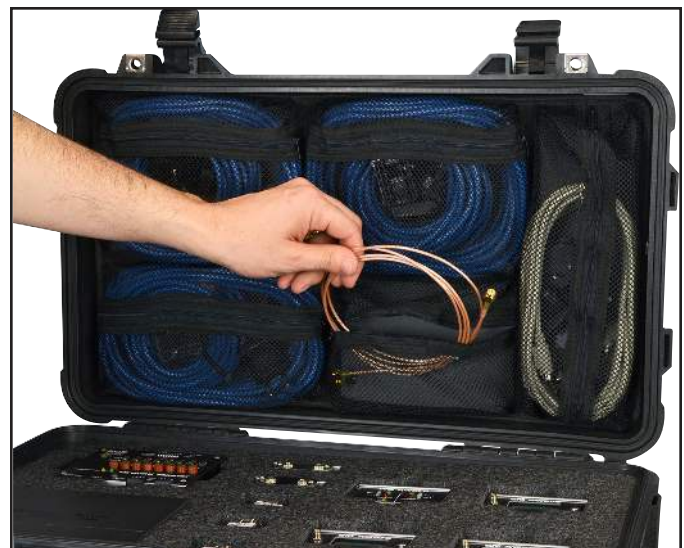
Figure 2. Using the the lid organizer to store accessories

Per ANSI/ESD S20.20 section 6.1.3.1 Compliance Verification Plan Requirement "A Compliance Verification Plan shall be established to ensure the organization's compliance with the requirements of the Plan. Formal audits or certifications shall be conducted in accordance with a Compliance Verification Plan that identifies the requirements to be verified, and the frequency at which those verifications must occur. Test equipment shall be selected to make measurements of appropriate properties of the technical requirements that are incorporated into the ESD program plan."