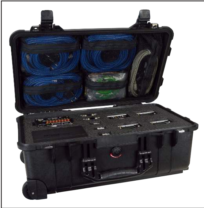
Figure 1. SCS 770050 SMP Diagnostic Kit